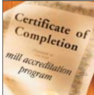
Supplier accreditation program

Committed to Excellence. Dedicated to Quality.