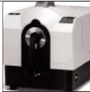
Color measurement system

You'll gain maximum benefit from your CIMS solution by using Datacolor's supplier accreditation program. This program ensures that your suppliers are complying with your color management processes.